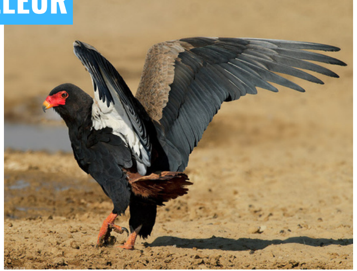
Bateleur ( Terathopius ecaudatus )

Also known as the Berghaan (Afrikaans), ingqungqulu (isiZulu), and ingqanga (isiXhosa), this magnificent raptor is famous for its striking appearance and remarkable aerial behavior. Indeed, a Bateleur ( Terathopius ecaudatus ) soaring high above the African bushel, with its rocking, gliding motion, is one of the most iconic sights of South Africa and, indeed our continent.