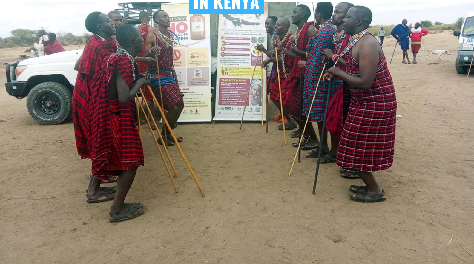
Community volunteers engage in traditional dances to create awareness on wildlife poisoning and vulture conservation during market outreaches in the Amboseli landscape.