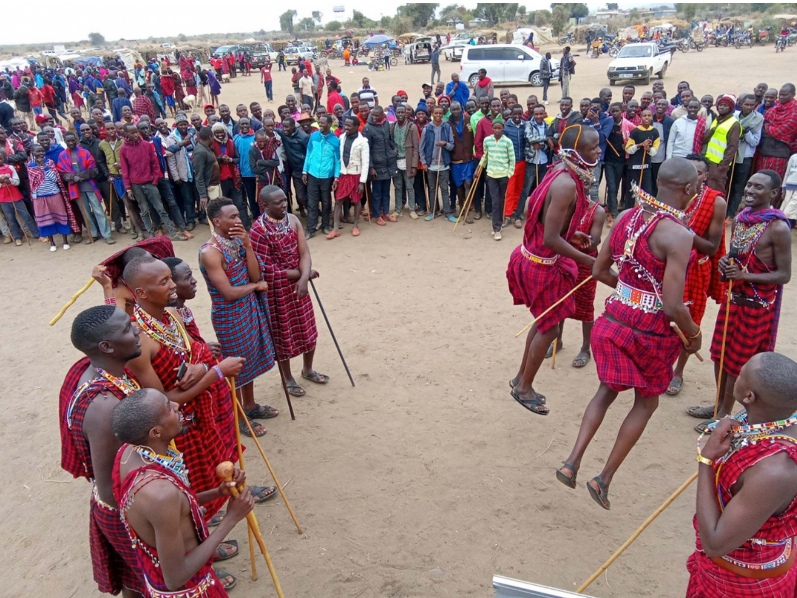
Community volunteers engage in traditional dances to create awareness on wildlife poisoning and vulture conservation during market outreaches in the Amboseli landscape.

Amboseli National Park is a designated Important Bird Area (IBA) and Key Biodiversity Area (KBA). Besides having many large wild animals like African Elephants, Black Rhinos, giraffes and lions, the park hosts over 400 bird species with more than 40 birds of prey, including the threatened Secretary bird, Martial Eagle, and Lappet-faced, White-backed, Hooded and Rüppell's vultures.