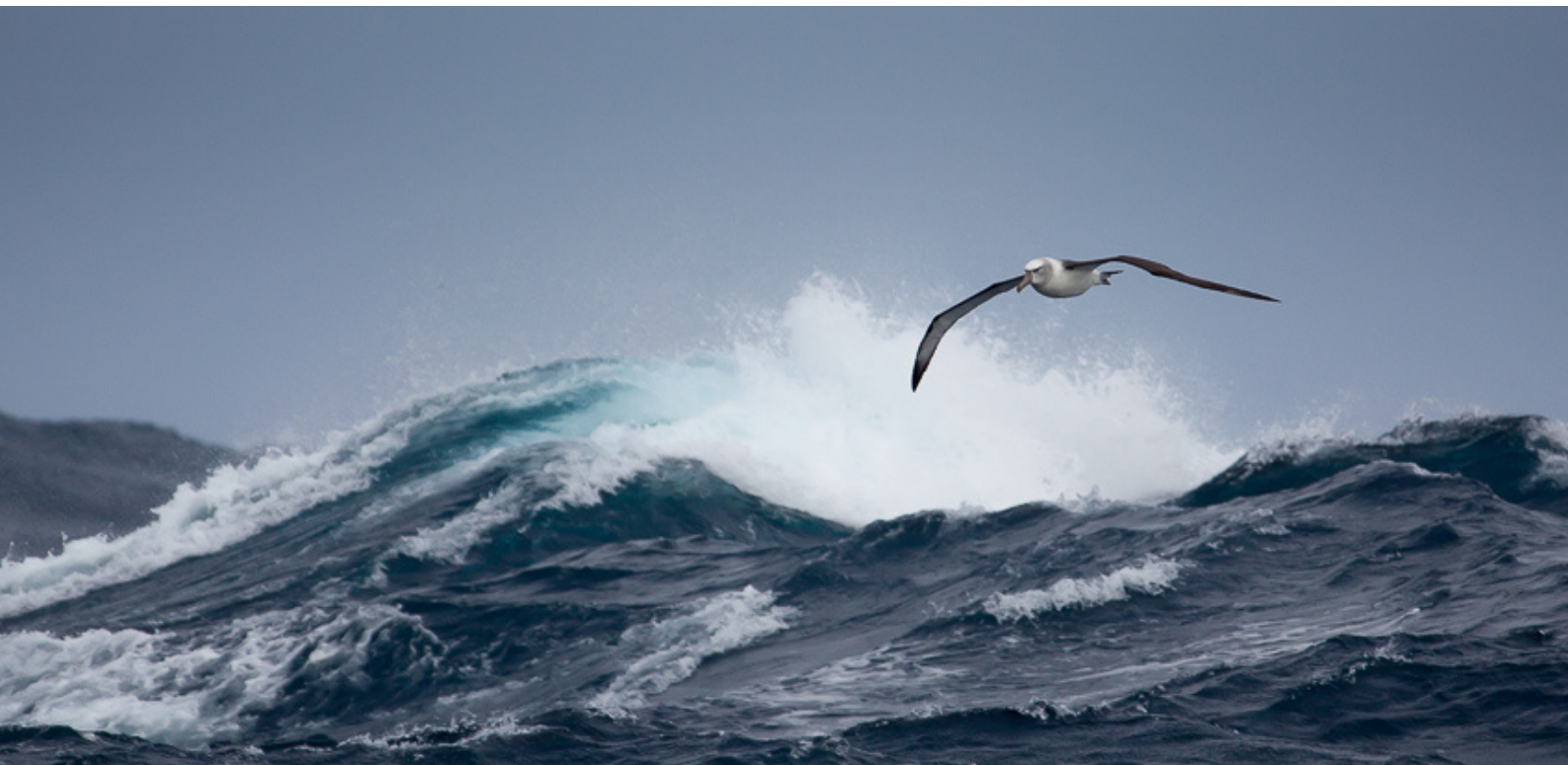
A Shy Albatross soaring across the middle of the Southern Ocean