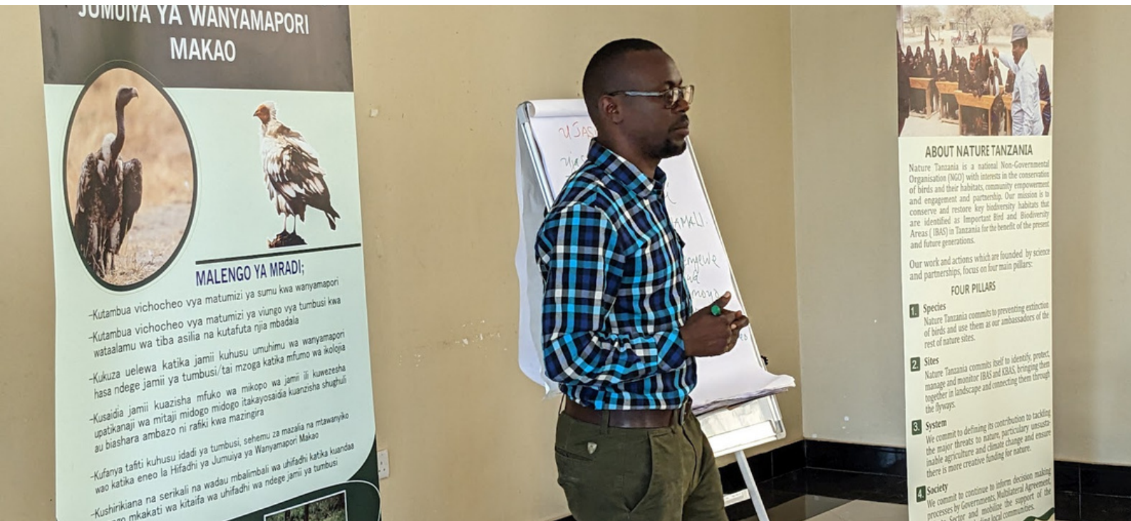
Entrepreneurship training