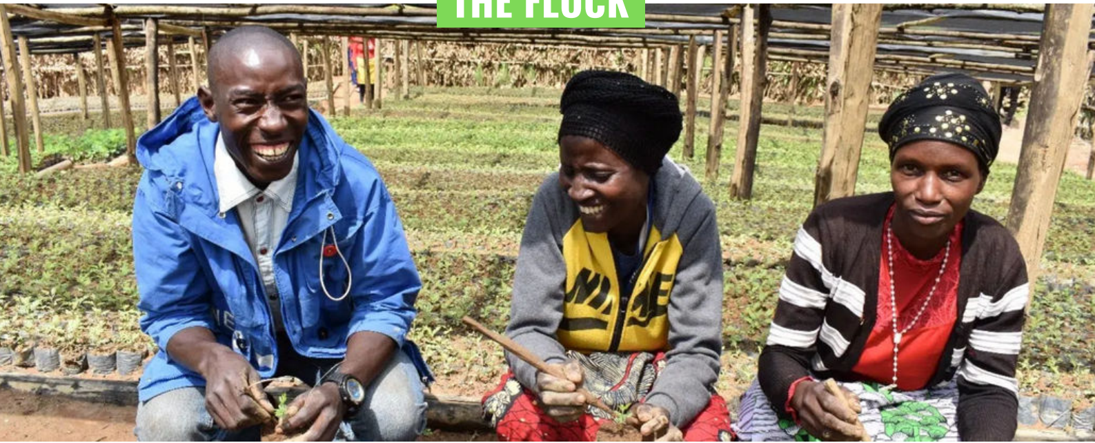
Community members transferring seedlings into seed pots at Butare nursery as part of Nature Rwanda's restoration work © Nature Rwanda