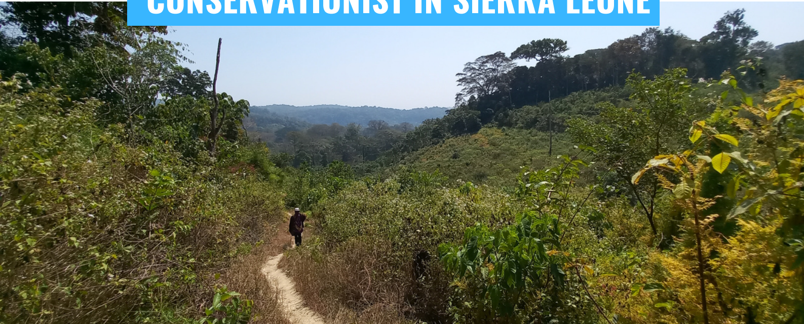
Gola landscape