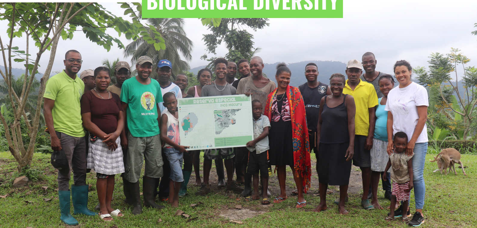
Awareness session with local residents of Pico Macuru (a Special Reserve)