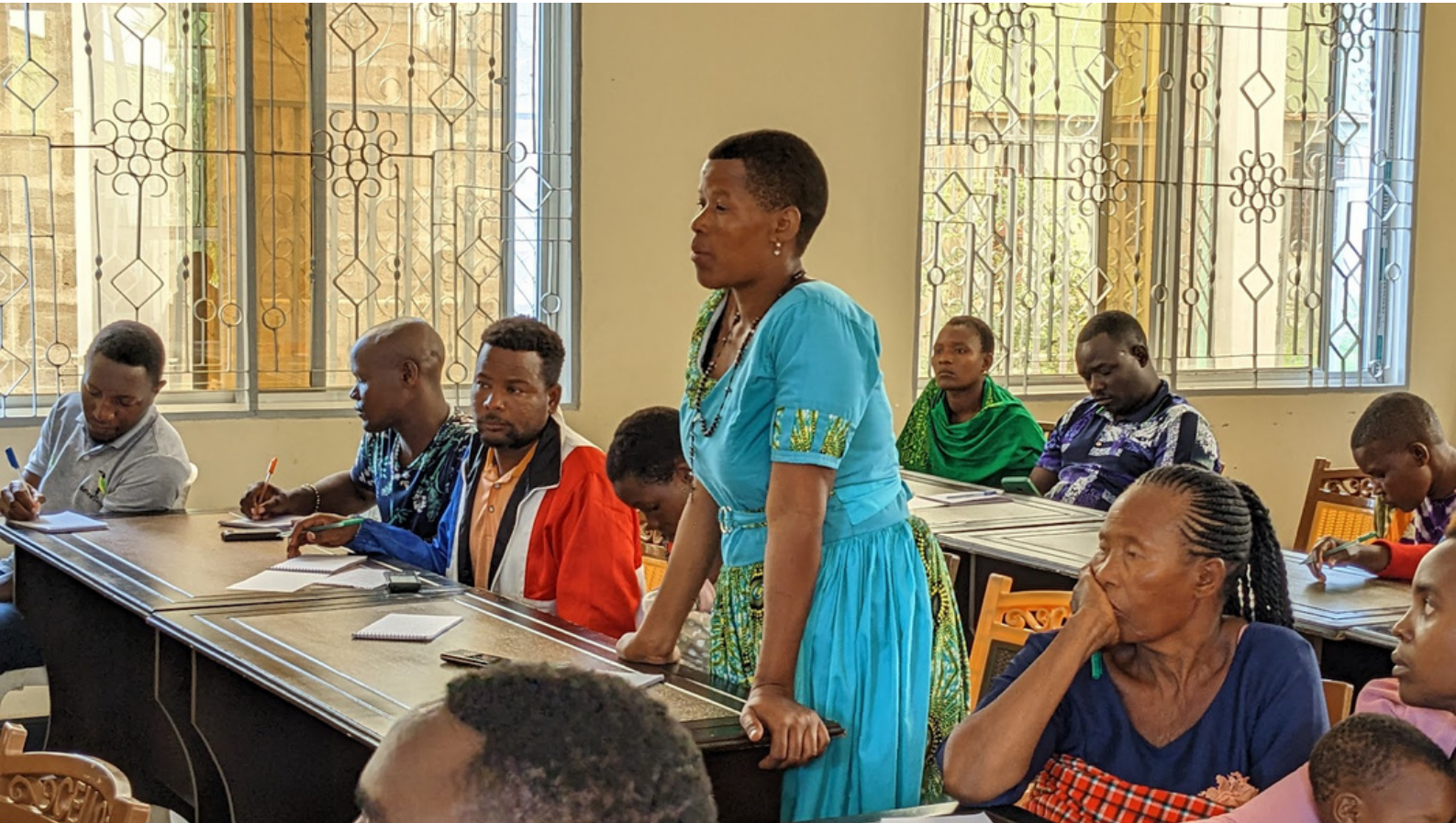
Participants during the entrepreneurship training

The committee is made up of representatives from the Meatu District council, Makao WMA, and Nature Tanzania. This committee evaluates loan applications, and conducts monitoring and evaluation of the granted loan projects where businesses are regularly reviewed. Further, community members are benefiting from capacity building trainings on entrepreneurship thus reducing pressure to the environment and helping address drivers of wildlife poisoning, including income losses linked to human-wildlife conflict and belief-based use of vulture body parts.