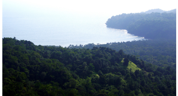
Aerial view of a Special Reserve