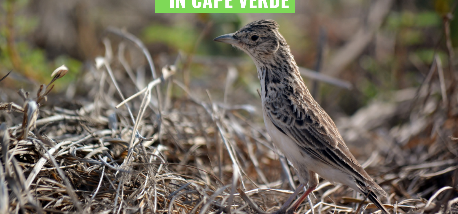
Juvenile of the Raso lark in the midst of vegetation on the small island of Raso in Cape Verde © Nathalie Melo