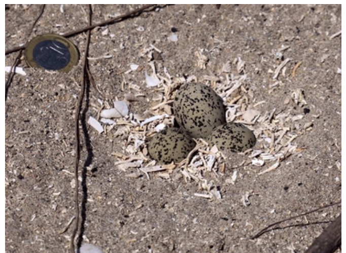
Chicks and nests of Red-necked Plover ( Charadrius alexandrinus)