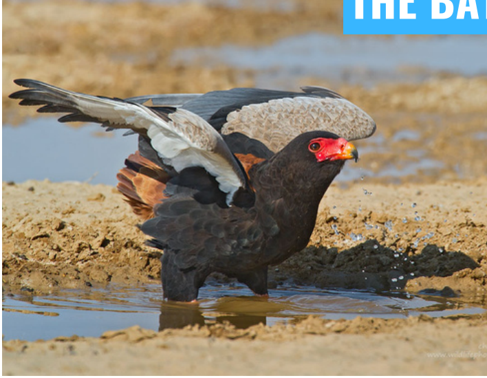
Bateleur ( Terathopius ecaudatus )