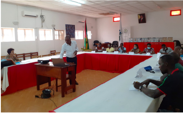
Meeting with community leaders in Me-Zochi district