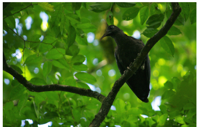
Sao Tome Ibis ( Bostrychia bocagei )

"The natural resources that exist in the 21 SRs are numerous, diverse and very valuable from a socio-economic and environmental point of view. We all need to realise this and find short and medium-term solutions to use the resources sustainably, before we reach an undesirable level of ecosystem degradation and biodiversity loss, which would lead to a diminished supply and impaired regulation of ecosystem services", says Conceição Neves, Project Leader for BirdLife International in São Tomé Island.