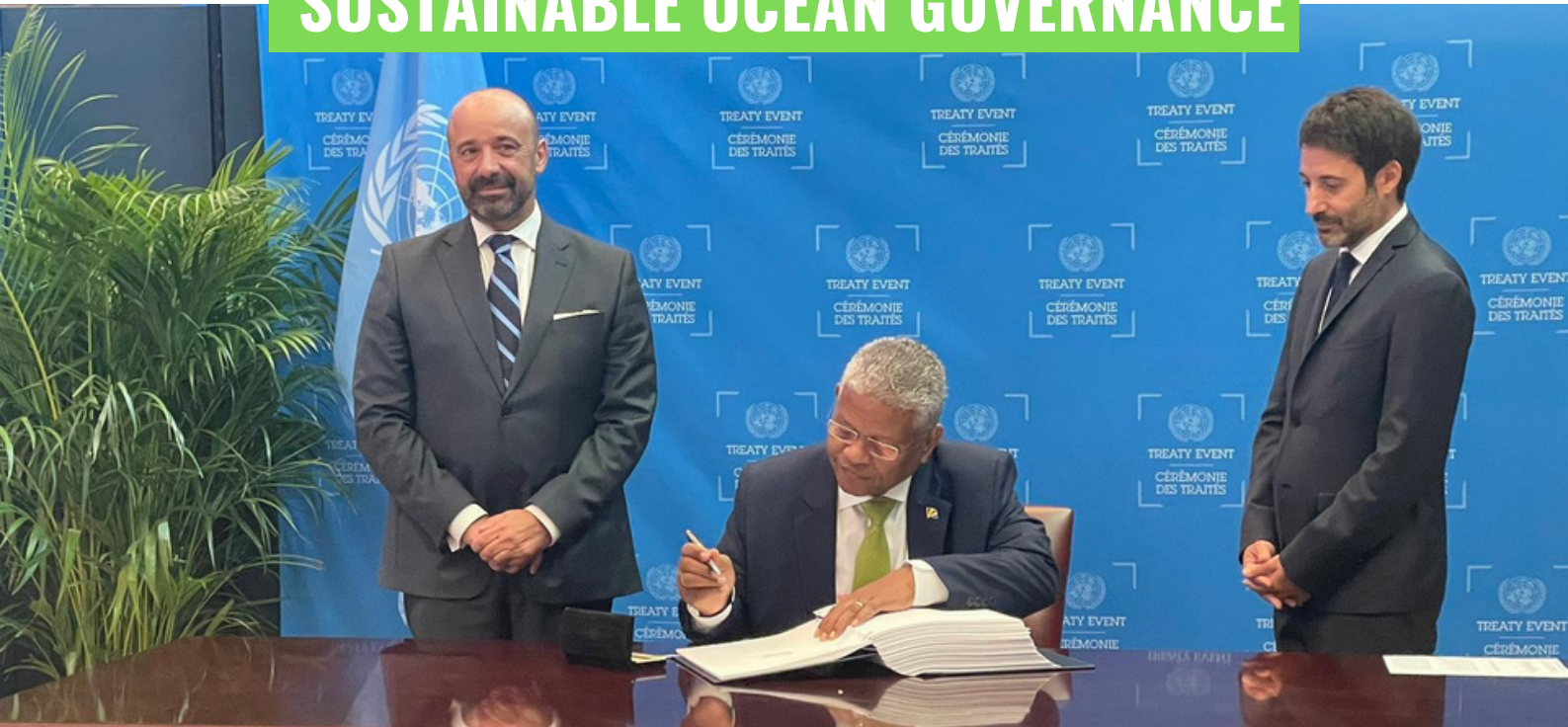
Seychelle's displays its commitment to conserving the high seas by signing the High Seas Treaty on September 20th, 2023, at the United Nations General Assembly