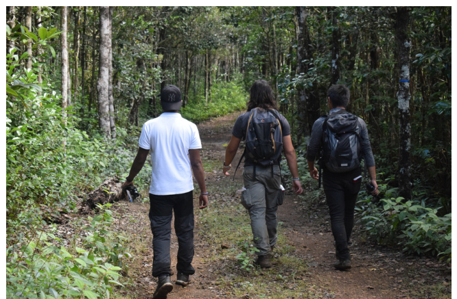
Everyday, the Pink Pigeon staff go in the forest to monitor the species