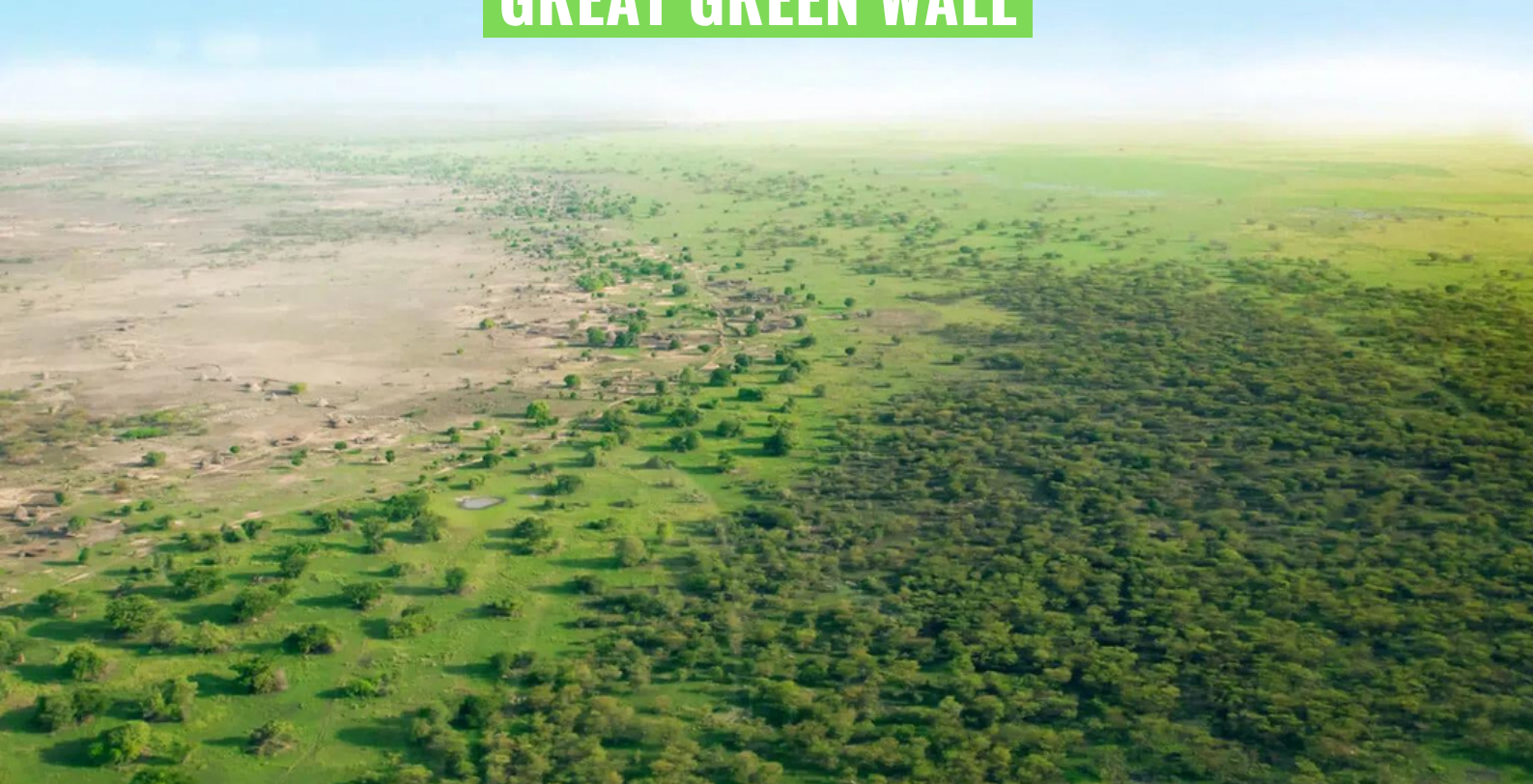
A visual representation of the ability of nature to hold back deserts