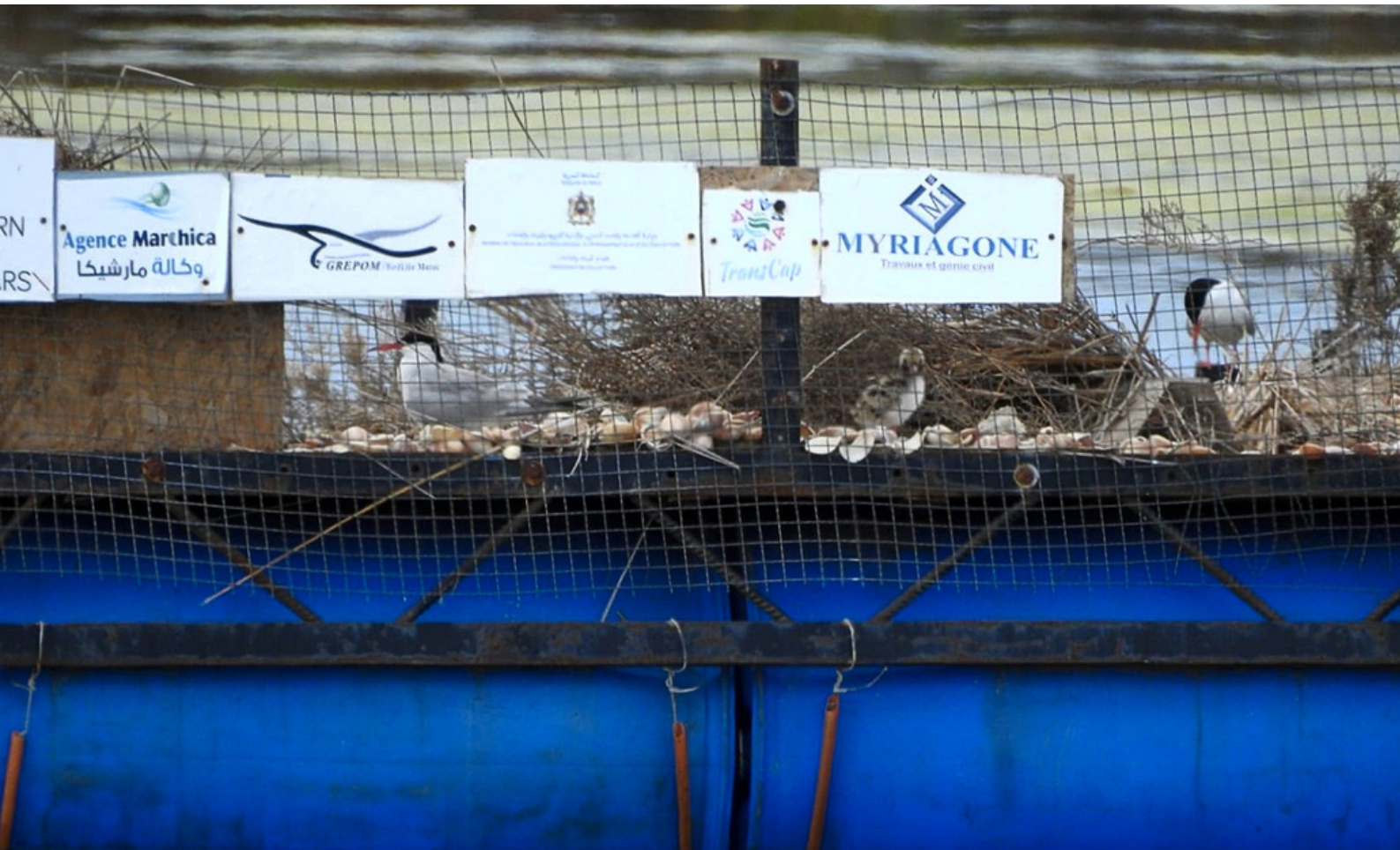
Common tern (Sterna hirundo) : 2 adults and 1 chick visible

Another successful project carried out by GREPOM was the restoration of a natural islet in the Oued Massa estuary - a Ramsar listed site in 2022. With the help of the management of the Souss Massa National Park (SMNP) and the National Water and Forestry Agency (NFWA), the islet was rehabilitated in the hope of creating new breeding habitats for shorebirds, terns, and gulls in the Massa estuary. On April 29, 2023, the first breeding records for the Red-necked Plover ( Charadrius alexandrinus ) was recorded, with 39 eggs in 13 nests on the rehabilitated island , making it, along with the Marchica, one of the very few successful habitat restoration projects in Morocco.