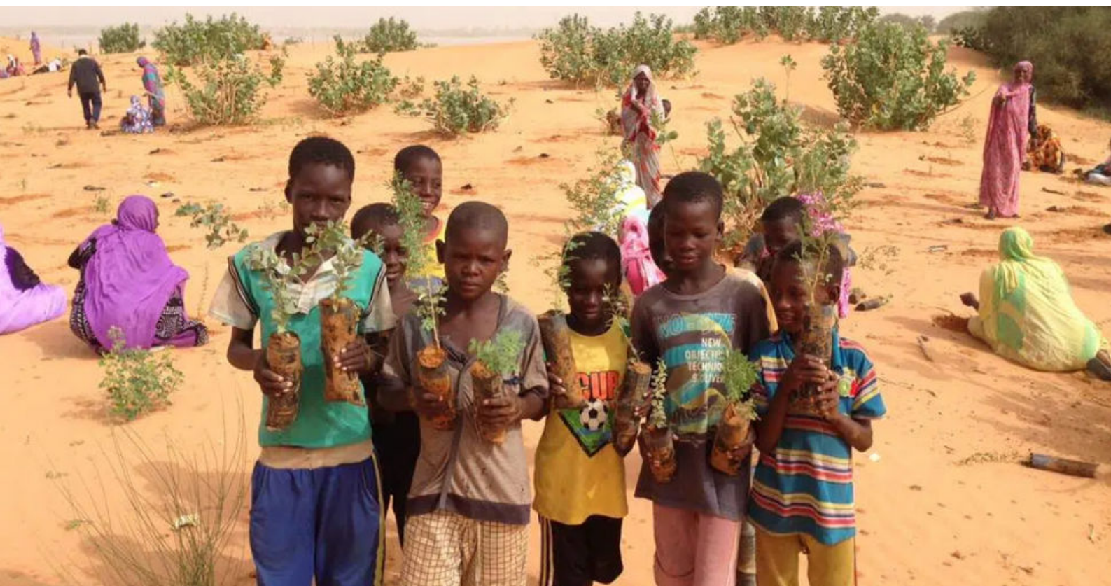
Future generations will reap the rewards of this work

Through collaborations between national agencies of the GGW and BirdLife Partners, biodiversity working groups has been established in Nigeria and Burkina Faso. In addition, contracts have been signed with Niger, Mali, and Mauritania to support the establishment of biodiversity working groups. The groups will be instrumental in supporting countries assess the impact of GGW activities on biodiversity, and consequently propose recommendations. As restoration activities continue to be implemented in the GGW countries, greater support for this initiative will be instrumental for a community driven green future for the Sahel.