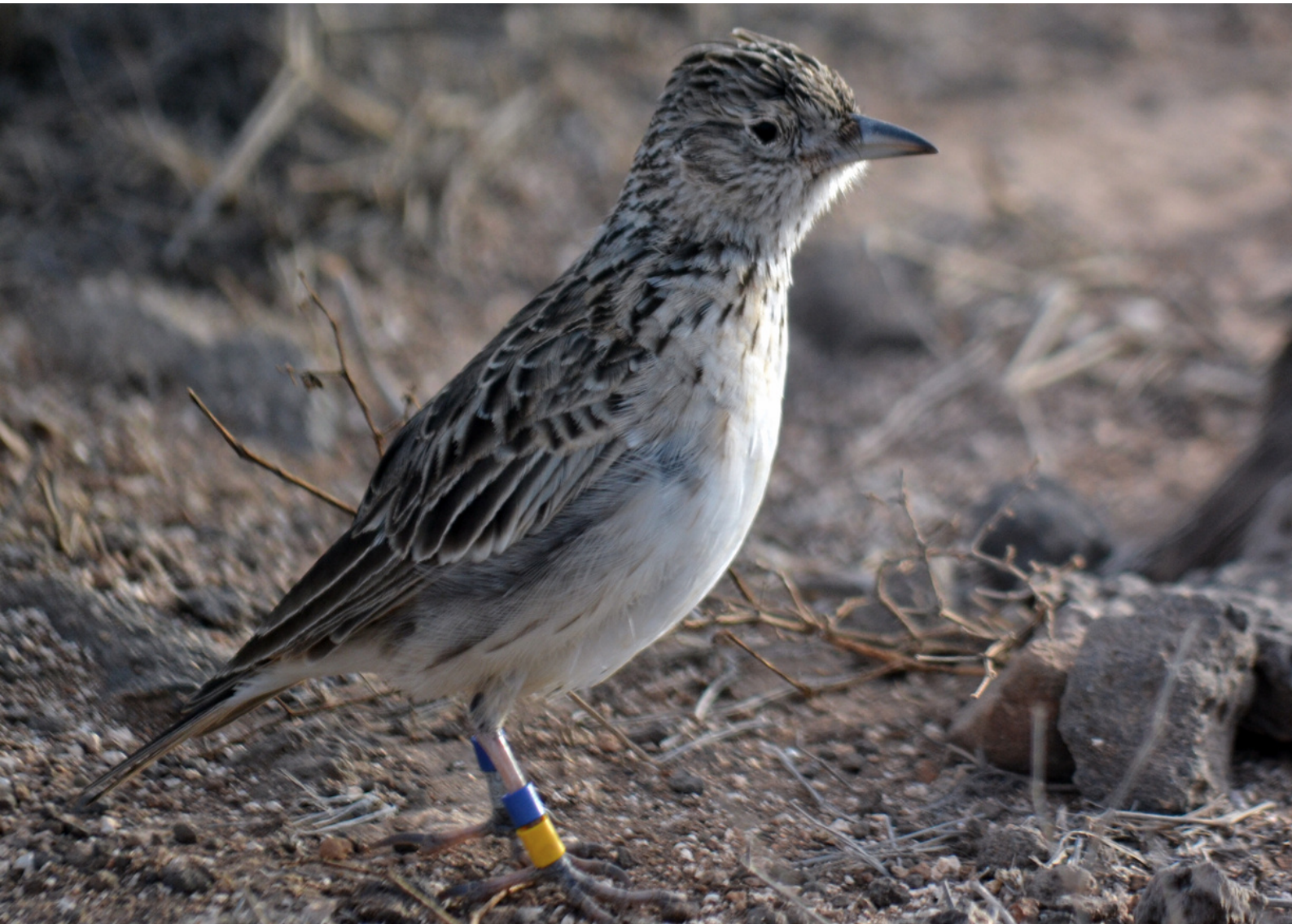
Raso lark ringed on the small island of Raso in Cape Verde