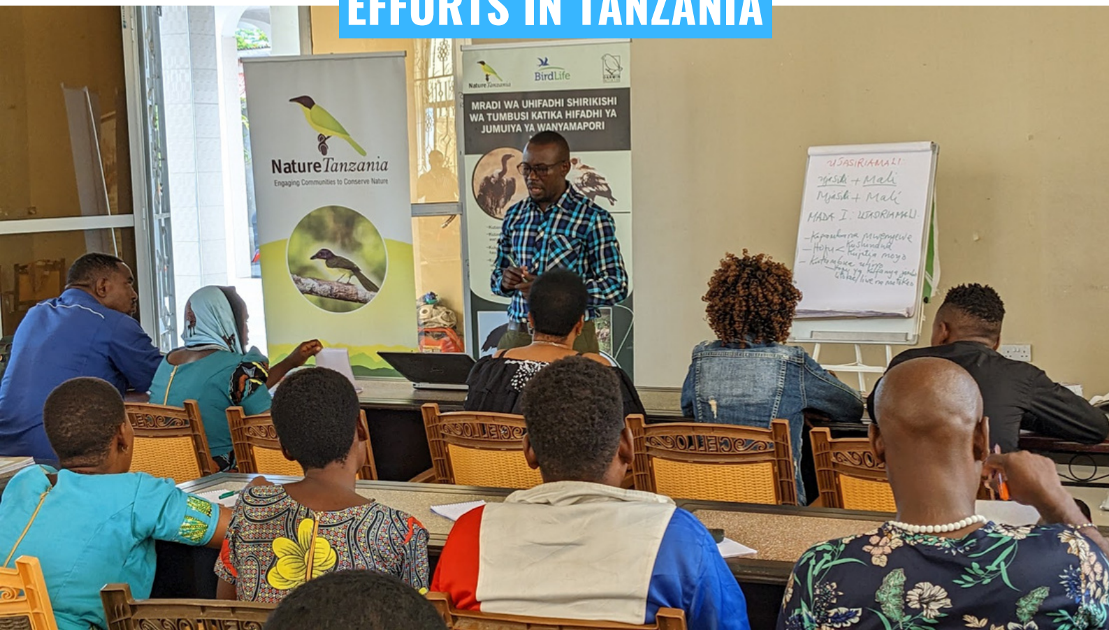
Entrepreneurship training in Tanzania