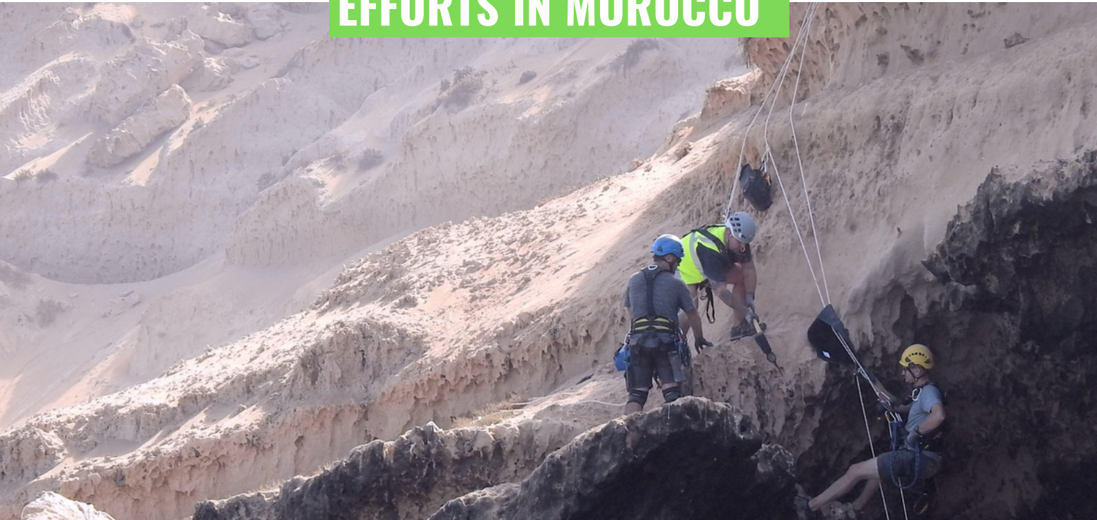
Mountaineers clearing Northern bald ibis nests in southern Morocco