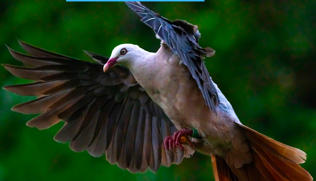
A Pink Pigeon displaying its amazing color nuances just before landing on a branch