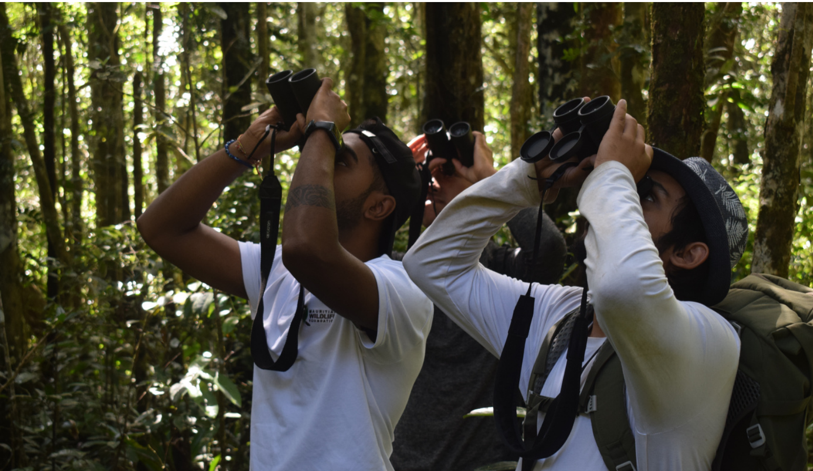
When a nest is found, the staff will observe it from distance without disturbing it

When a nest is found, the team member will observe the nest from the ground using binoculars. The breeding pair will be identified by their unique combination of metal identity ring and plastic color leg rings.