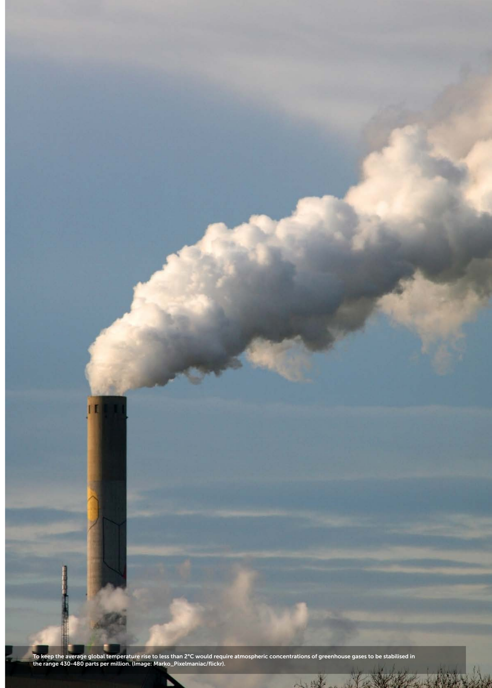
To keep the average global temperature rise to less than 2°C would require atmospheric concentrations of greenhouse gases to be stabilised in the range 430-480 parts per million. (Image: Marko_Pixelmaniac/flickr).