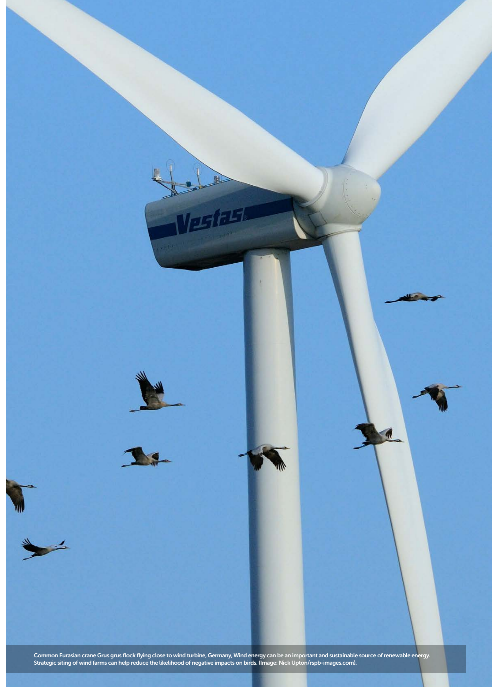
Common Eurasian crane Grus grus flock flying close to wind turbine, Germany, Wind energy can be an important and sustainable source of renewable energy. Strategic siting of wind farms can help reduce the likelihood of negative impacts on birds.