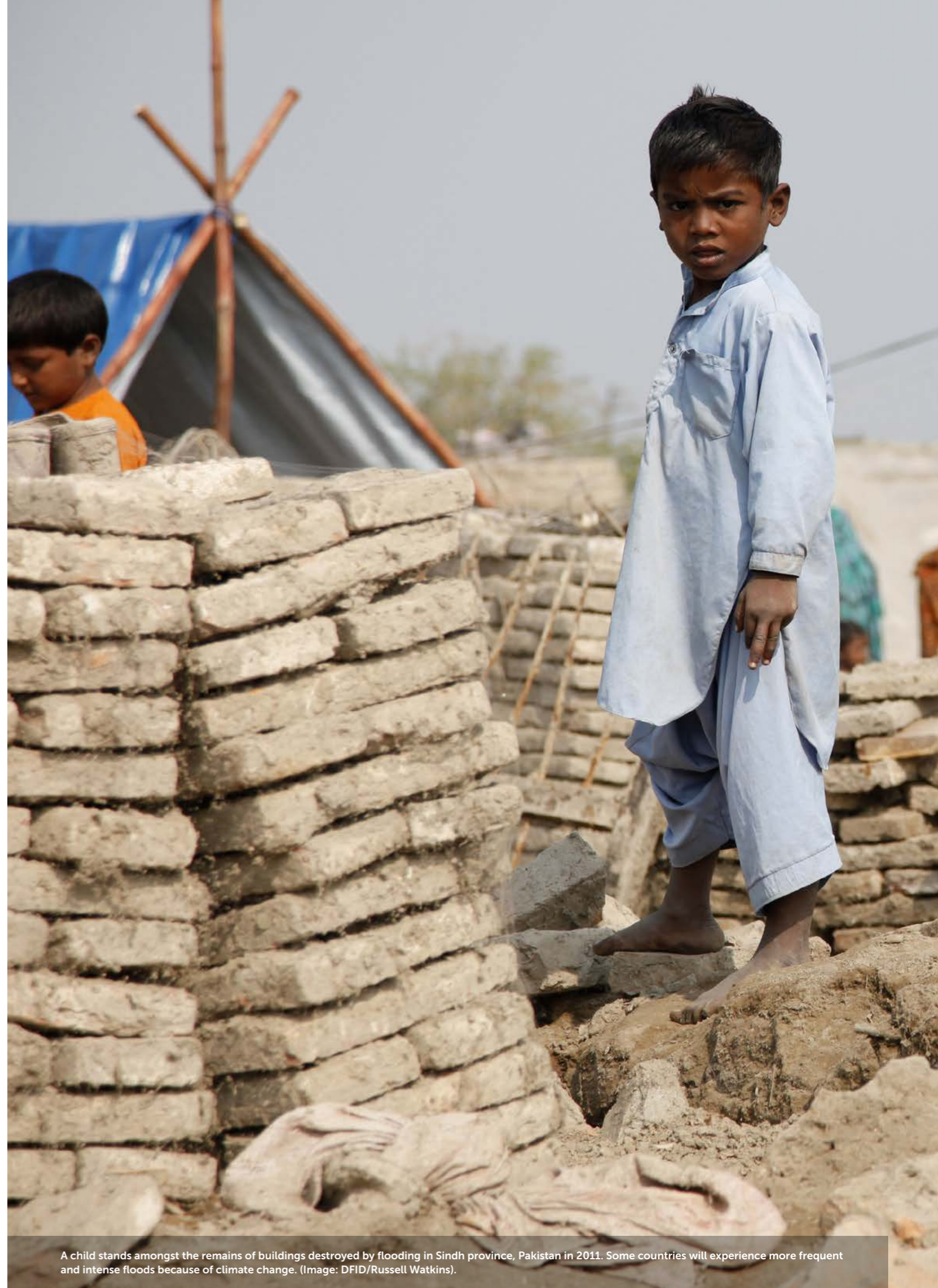
A child stands amongst the remains of buildings destroyed by flooding in Sindh province, Pakistan in 2011. Some countries will experience more frequent and intense floods because of climate change. (Image: DFID/Russell Watkins).